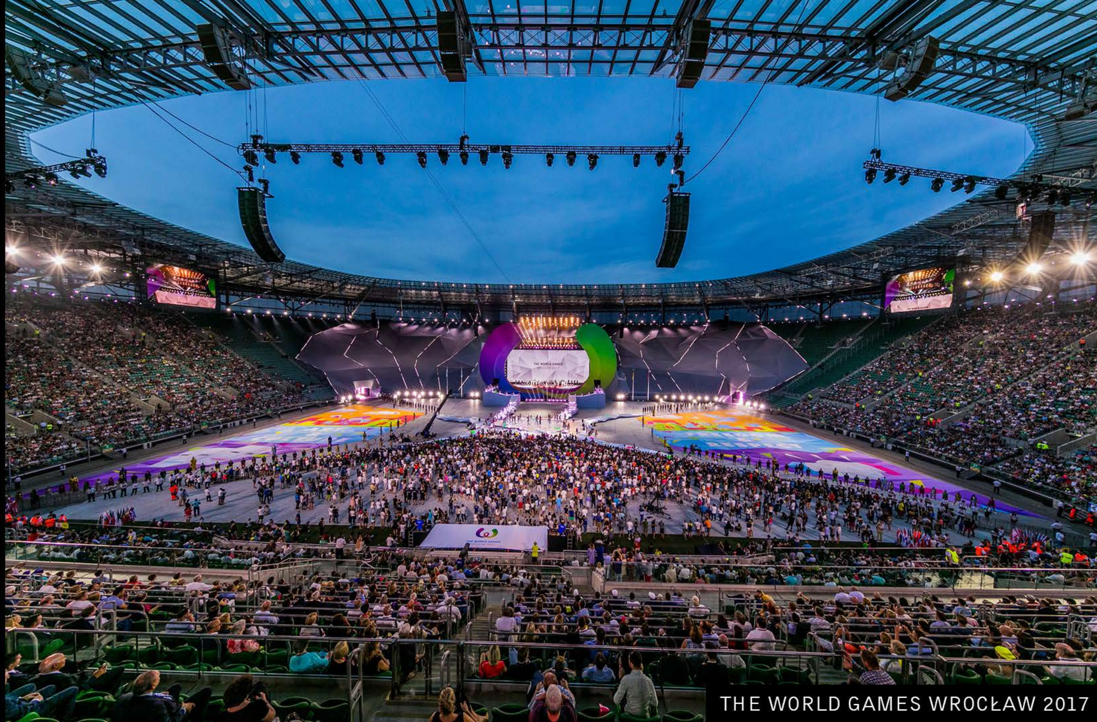
THE WORLD GAMES WROCŁAW 2017