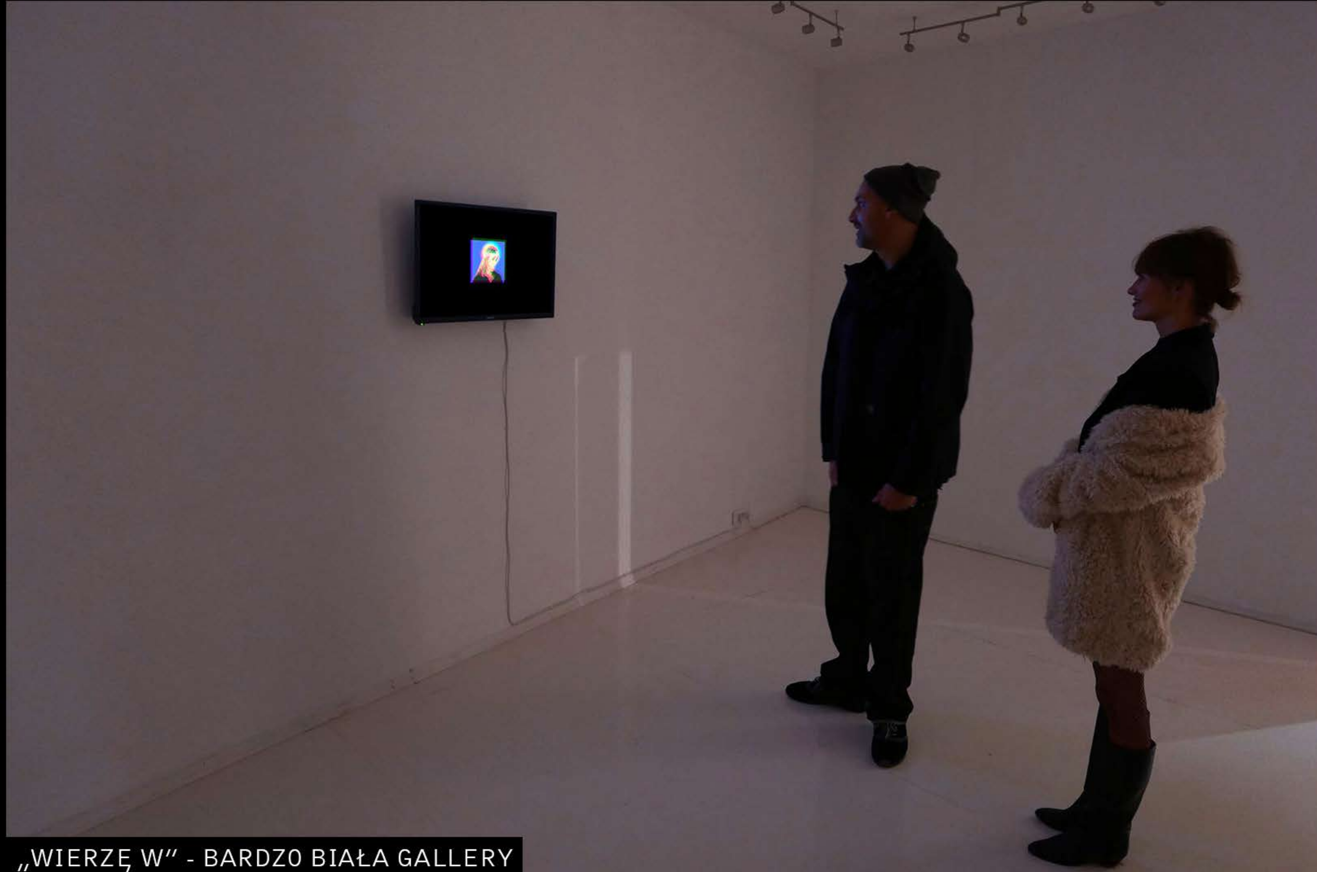
„WIERZĘ W” - BARDZO BIAŁA GALLERY